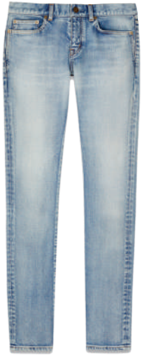
ALL KIND OF JEANS